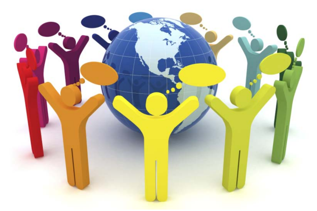
Global + Collaborative + Neutral