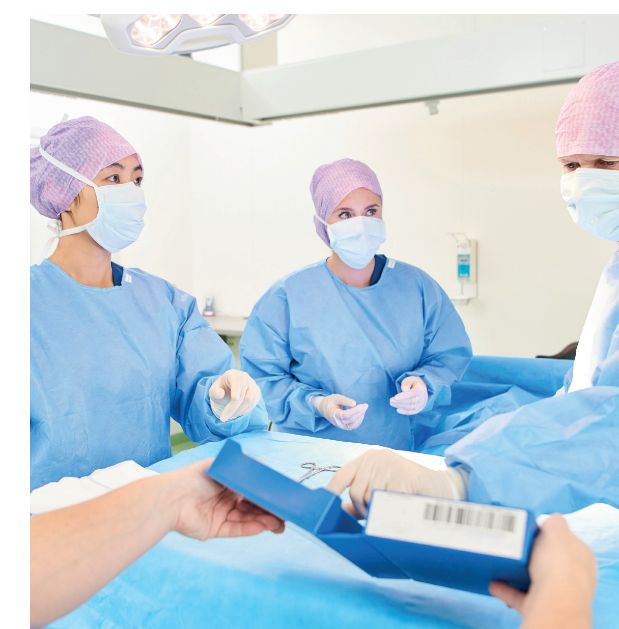
Ensure track and trace