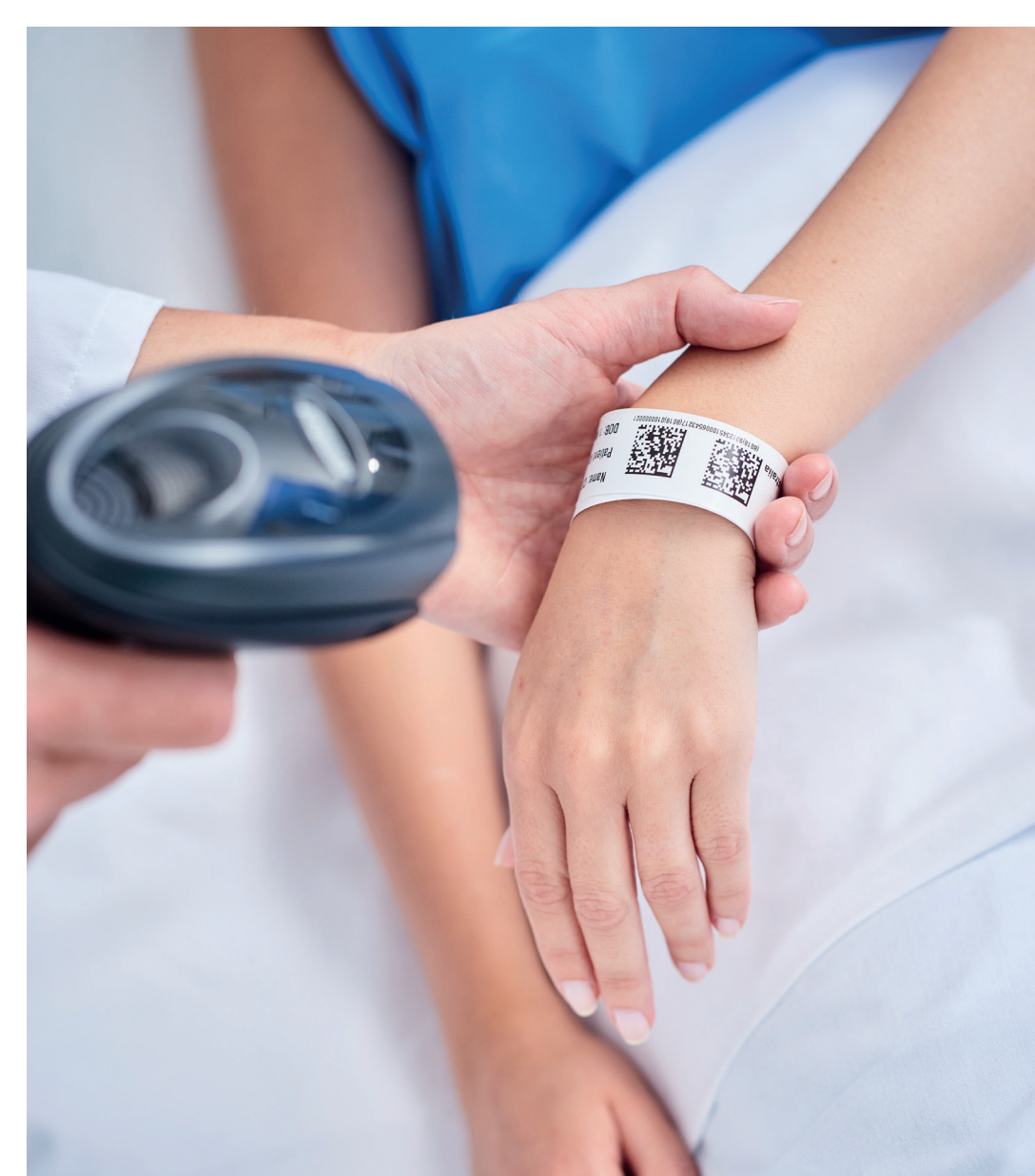
Patient and care provider identification