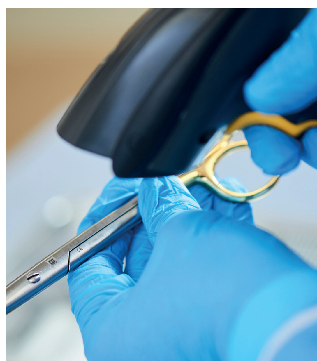
Healthcare product identification