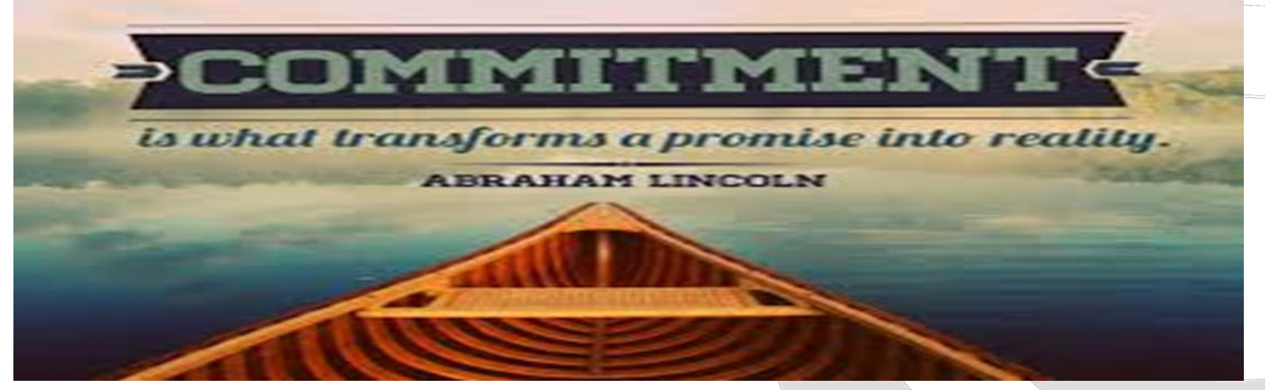
Finally, We are Committed to Combat Counterfeit in Egypt