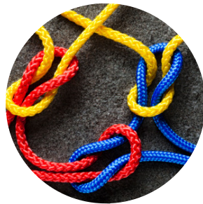
supply chain security & efficiency